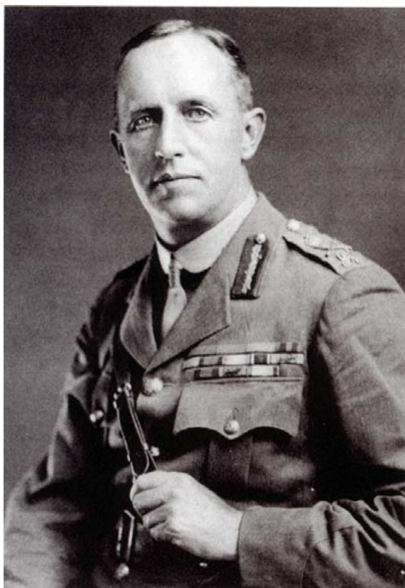
General Sir Andrew Skeen