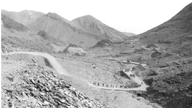
Main body of 48th Regiment moving to Razmak