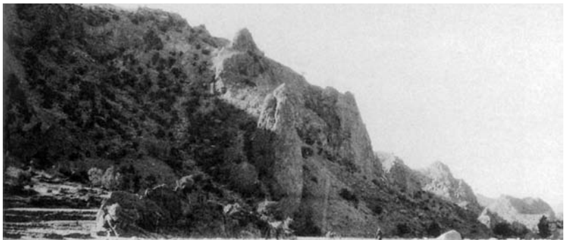
Mountainous terrain (NAM 96899)