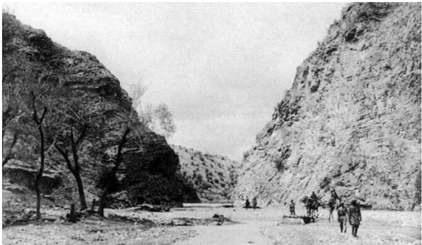
Dominating terrain for a march column (NAM 98080)